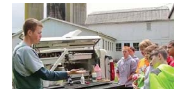
First Annual Agriculture Career Days