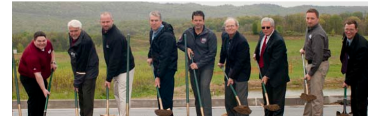
Groundbreaking for Central States Manufacturing, Inc.