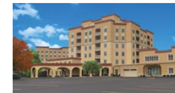
Graystone Grande Palazzo