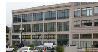
Penn State Altoona Penn Building