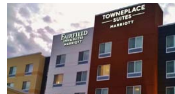
Fairfield Inn & Suites and TownePlace Suites