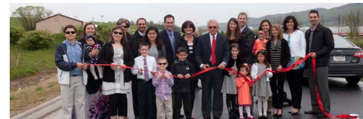
Dedication of the Martin J. Marasco Business Park