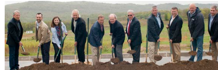
Groundbreaking for Sheetz Store Operations, Learning Center and Daycare Complex